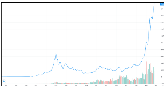
Total crypto market cap reached >$2T over 5 years 1